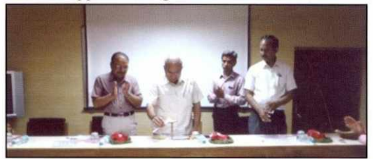
Training on "Qualitative production, value addition, and business approach for doubling farm income"

consisted of a host of lectures by scientists on water management, use of mulching in agriculture, farm production-market linkage management, the business approach in agriculture etc.