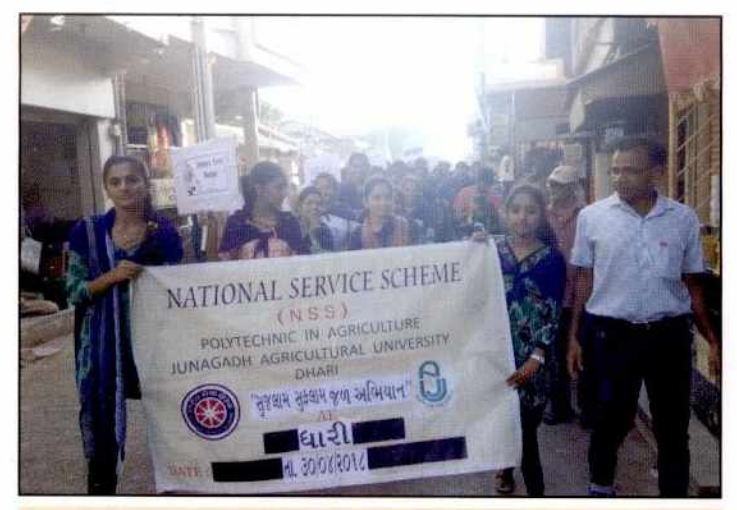
Volunteers of NSS, Polytechnic College, Dhari promoted the awareness amongst people of Dhari about the water saving on the eve of the launching of "Sujlam Suflam Jal Sanchay Abhiyan" by the Gujarat of Gujarat from May 1-30, 2018