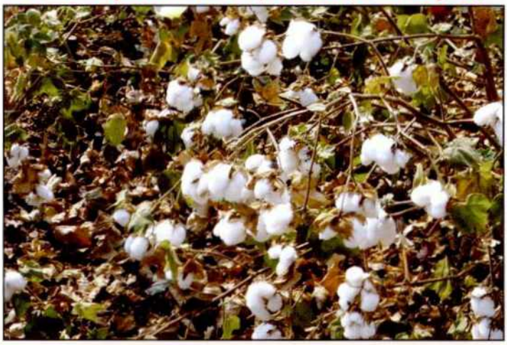
Gujarat Cotton Hybrid 22 (G. Cot. Hy 22)

Gujarat Cotton Hybrid-22 is a Non-Bt hybrid cotton recommended for irrigated condition in Gujarat state. The hybrid has recorded 2865 kg/ha mean seed cotton yield with 1010 kg/ha lint yield. It has 34.7 % ginning out-turn and 18.37 % oil content. The hybrid is medium late in maturity.