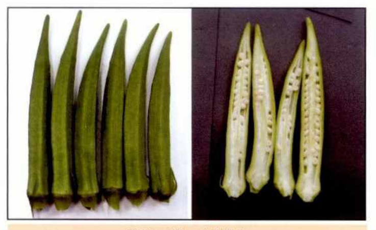
Gujarat Okra 6 (GO 6)