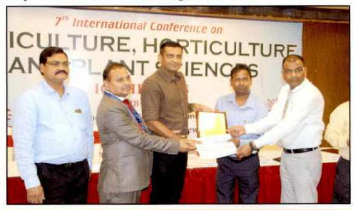
"Outstanding Scientist Award 2018"

Entomology, College of Agriculture, JAU, Junagadh was awarded "Outstanding Scientist Award 2018" in 7<sup>th</sup> International Conference on Agriculture, Horticulture and Plant Science organized by "The Society of Tropical Agriculture" during June 28-29, 2018 at Shimla, H.P., India. He also awarded the "Certificate for Best Research Paper Presentation" during the same conference.