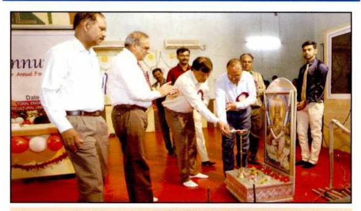
Inaugural of Frennuwell 2018 at College of Agricultural Engineering and Technology, JAU, Junagadh on April 17, 2018