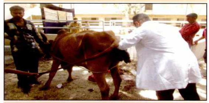
A special Veterinary Clinical Camp sponsored by Saurashtra Pranikalyan Trust, which was organized by Bhanvad Mahajan Panjarapol Gaushala, Bhanvad in collaboration with CoVS&AH, JAU, Junagadh and Animal Husbandry Department, Devbhumi Dwarka on May 5, 2018, at Bhanvad