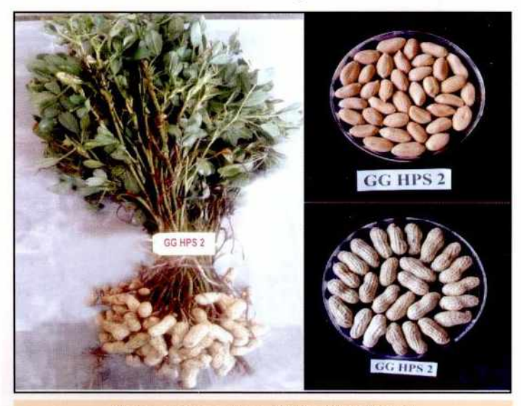
Gujarat Groundnut-HPS2 (GG HPS 2)

This is a large seeded confectionery type groundnut variety recommended for cultivation in Gujarat state during Kharif season. This variety has recorded a mean pod yield of 2835 kg/ha. It is resistance to tikka and rust diseases as compared to check varieties.