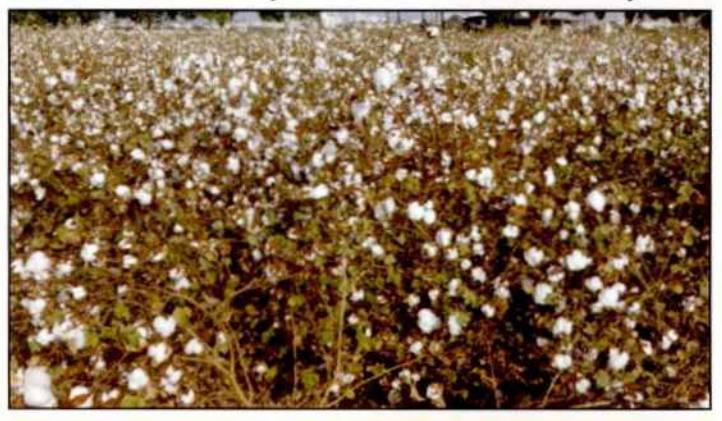
Gujarat Junagadh Cotton 102 (GJ. Cot 102)

Gujarat Junagadh Cotton-102 (GJ Cot 102) is Non-Bt cotton for growing in Gujarat state under irrigated condition. It has recorded a mean seed cotton yield of 2215 kg/ha. The lint yield in is 769 kg/ha with 35.1 % ginning out-turn and 18.32 % oil content. This variety is medium late in maturity.