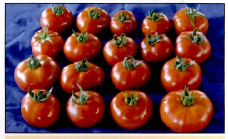
Gujarat Tomato 6 (GT 6)

Gujarat Tomato 6 is recommended for the farmers of Gujarat during the late Kharif-rabi season. The variety has recorded a mean fruit yield of 316.00 q/ha. The fruits are medium in size, flat round in shape with an attractive red colour and 3 to 4 locules with high T.S.S. It is found superior against leaf curl and fruit borer infestations compared to all the check varieties.