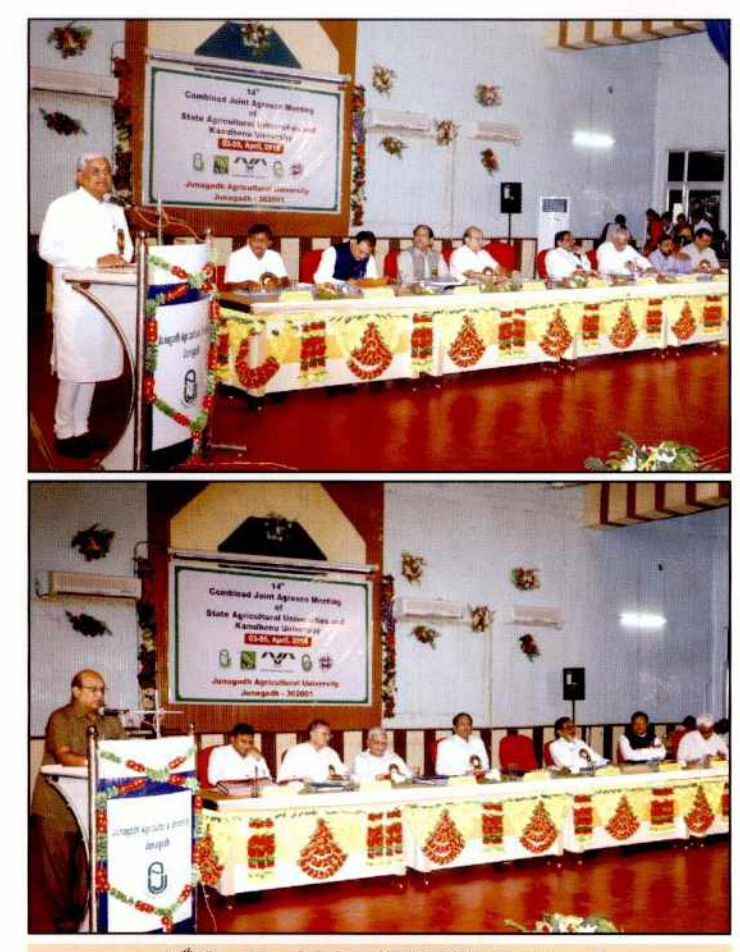
14<sup>th</sup> Combined Joint AGRESCO Meeting of SAU's and Kamdhenu University